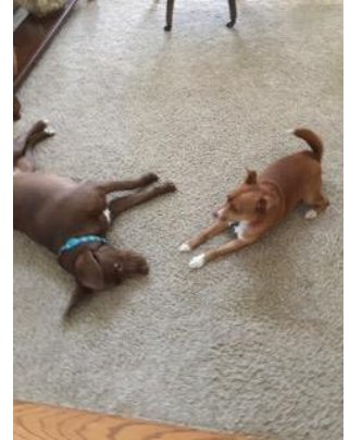
Kipp was adopted by a young man whose parents had adopted Ivy (dog on the upper right) from us. They get to play together frequently and get along great!