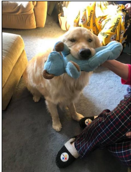
Teddy loves his new home and new toy!

Major found a great home with a couple who adopted an older shepherd from us a few years ago. This is his view!