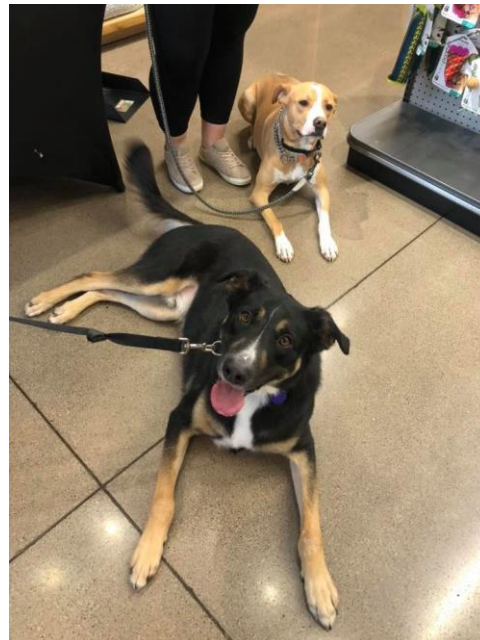
Vinny and Penelli at our adoption event!