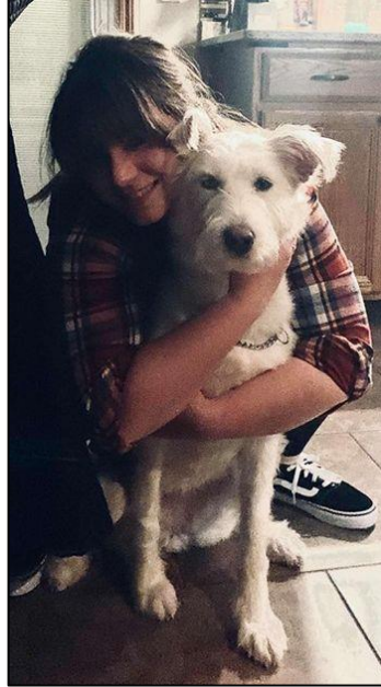
Bowie was rehomed.