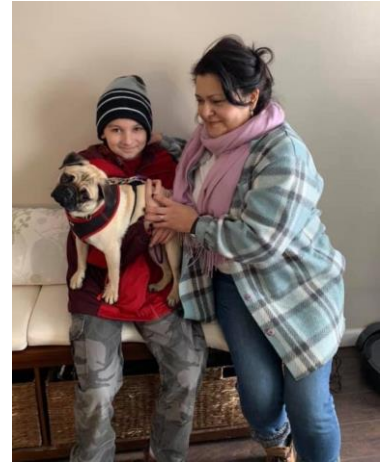
Elvis has left the building and is happy with his new family.

Things are going really well with Penny. Yesterday was her first day eating 2 cups of food. When I went to work she didn't want anything to do with the crate, so I left her out. She did fine except for a few bent mini-blinds. I need to remember to leave the blinds up so she can look out. She is a doll! Is responding well to commands and comes in from the rain when called. Looking forward to better temps so that she can get a walk before and after work. Thanks again for all of your help getting this sweet girl!