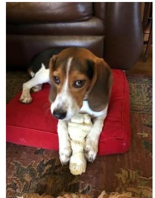
Griffin found his forever home last week and is already loving his new canine sister Daisy! His new family reports he's been quite her shadow and they are figuring each other out quickly!