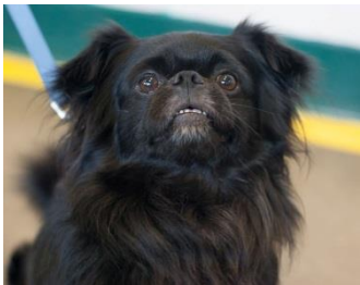
Prince before haircut and after. He looks totally different.