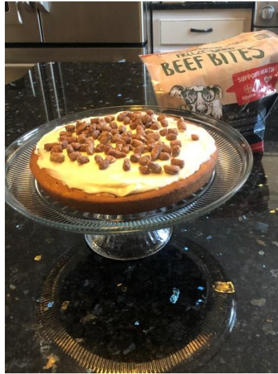
Major had a birthday celebration. He is adjusting great and everyone who meets him loves him.