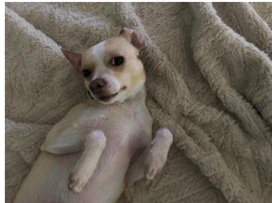
Miles is doing great. 😊 He's near perfect with me, but we still have a ways to go with my kids... he's gradually becoming warmer with them, though. Very happy he's part of our family!!

We love this little rascal, Joker. It's been wonderful to watch him become comfortable at home and feel like he's part of the family. He put on a little weight, so we are watching that. He's very healthy, much more calm in every way, and really settling into a routine. He got a second bed recently so now he has one upstairs and downstairs. Thanks for checking in, you guys are thoughtful and clearly good at looking out for these rescue dogs. This one is enjoying being spoiled, and we are just about to go on a nice long walk, so I'll expect a wagging tail shortly!