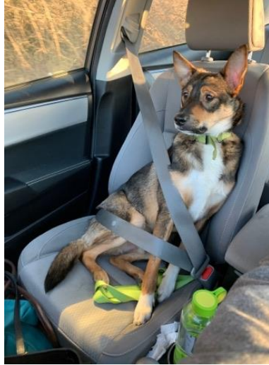
Cain's first day going to day care and looks like he's saying "but Mom, will I like it?"