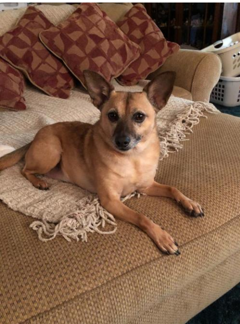
Penny was adopted and is still timid but adjusting to her new home. She loves her morning walks and claiming the blankets on the couch. Belly rubs are always appreciated too!