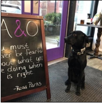
Dresden goes to work with his owner and hangs out at a shop and greets customers.

Dresden is doing great! He's so smart and so loving. My husband lays on the floor with him almost every night. Trust me, that is a big deal! He's been improving his leash skills and with the help of a sound/vibrating bark collar he's been getting better at not barking at the customers coming in. He loves greeting them, but he can be loud! We're doing our best to stay with his skill set of commands. Tell the handler that the one commands where he will sit, then lay, then roll over is funny. He will do it for my husband step by step but for me, as soon as he lays down he rolls over! I can't get him to just lay down and stay until I make the command to roll. Ah well! We also took him to a daycare one afternoon. He went right in and had no issues. He's not much of a dog's dog so he just hung with the humans. My last dog was like that, too. That yellow ball is his favorite thing!