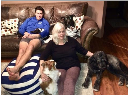
Gunner has some dog friends to play with now.