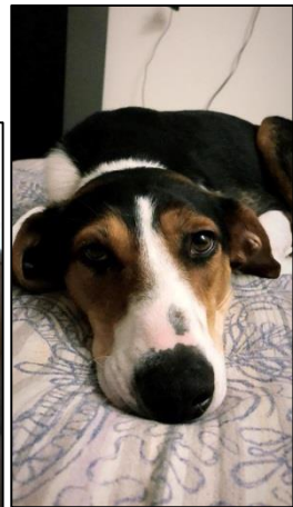
Clark is enjoying his foster home and being very good.