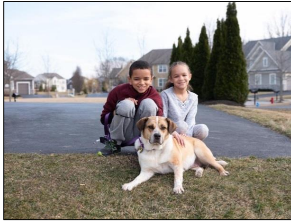
♥ The whole family loves Cora. ♥