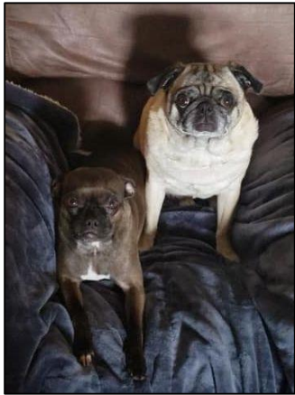
Reece and her pug sister are close. Reece is doing well with her family and sleeps with her human brother. They love ♥ her