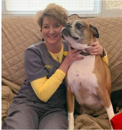
Chevy's doing well.