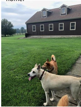
Finkle lives on a farm with horses, siblings and lots of room to run.