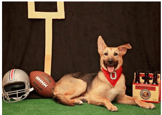
Adele helping at a photo fundraiser event.