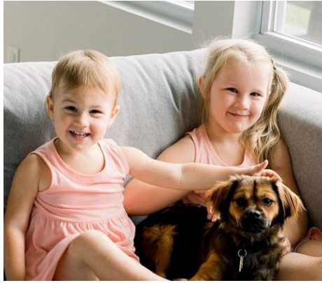
Ike and friends.

We had 16 adoptions in September and these dogs were trained in PUPP.