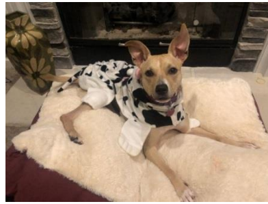
Tetra celebrated Halloween as a cow in her foster home.