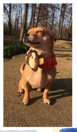
I'm betting Scottie got some turkey on Thanksgiving.