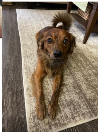
Wolf in his foster home.