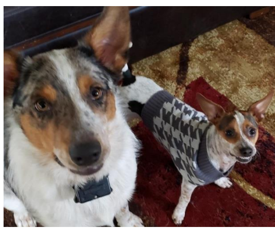
Look at Remus' big smile in his new home.

We had 12 adoptions in November and these dogs were trained in PUPP.