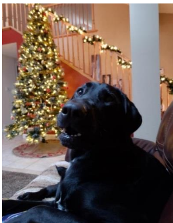
Thor - home, sweet home.

Merry Christmas and Happy New Year from Purebred Rescue.