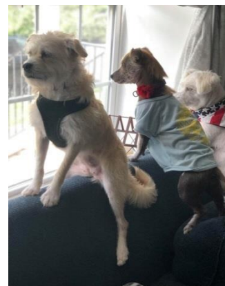
Reece and Ellie Mae are still looking for permanent homes.